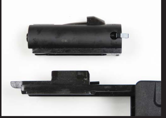
The bolt has a PVD finish and an oscillating locking lug on the upper part.