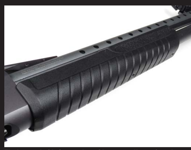
The long and wide fore-end provides an excellent grip and allows the user to adopt different shooting stances.

Between the stock and the receiver there is a sling attachment point and below the magazine tube cap there is sling swivel. Furthermore, on the rear part of the buttstock there are two attachment points, one on each side, for a QD sling swivel.