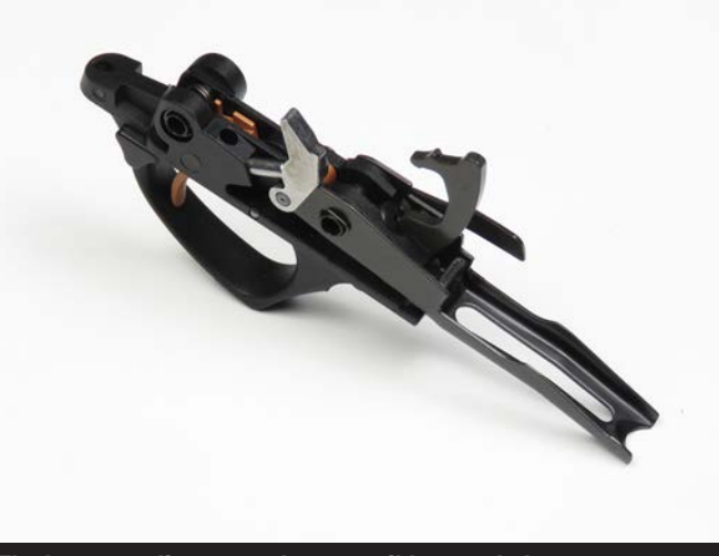
The button to disengage the reversible crossbolt safety is oversized.

The barrel has a 3-inch chamber and is compatible with steel shot. The barrel is subjected to a special proof test with ammo that develops 1,630 bar of pressure (23,641 PSI).