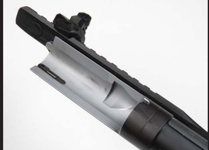
The breech extension, with the recess for the locking lug and the ejector. On the rear of the cantilever rail there is a rubber pad that prevents the receiver from getting scratched while mounting the barrel.