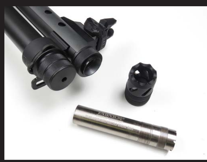
The barrel has a Tribore HP internal profile and is equipped with an Accuracy removable choke that can be used to mount the aluminum muzzle brake. The front sling swivel can be positioned at 3, 6, or 9 o'clock.

The barrel has the Tribore HP internal profile, a distinctive feature of Fabarm's shotguns, which has a first section after the over-bored chamber, a second cylindrical section and a third section that is slightly tapered. The original SDASS had a fixed cylindrical choke, while the Stage 2 has an Accuracy removable choke with a length of 82 mm for the internal part and 15 mm for the external part. The external part is threaded and an aluminum muzzle brake can be mounted on it. Obviously, the shotgun is compatible with all Fabarm HP chokes, allowing the shooter to tune the shotgun's performance with different types of ammo. The barrel and