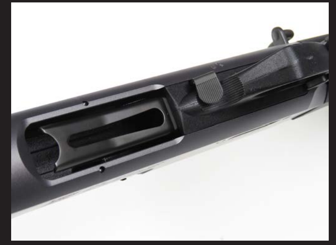
The lifter has a PVD finish.