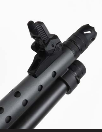
The flip-up front sight is mounted on a special ramp. The vented heat shield uses the same carbon gray Cerakote finish as the receiver.