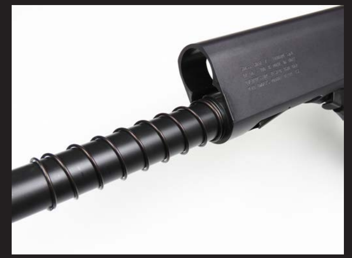
The magazine tube is made of aluminum instead of steel, to improve the balance of the gun. The spring that automatically pushes the fore-end forward can be easily removed if the user doesn't want to use it.